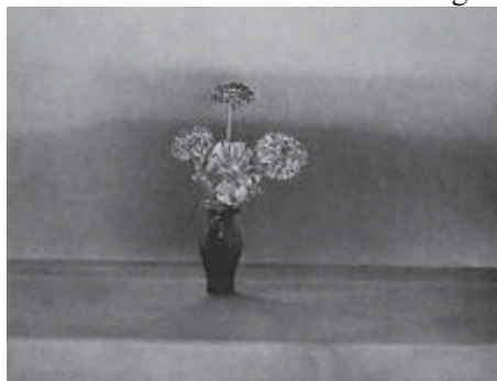
Single Flower Vase by James D. Butler

A RAFFLE will be held of the print Single Flower Vase by James D. Butler. The 14 5/8 x 19 3/8 inch image is