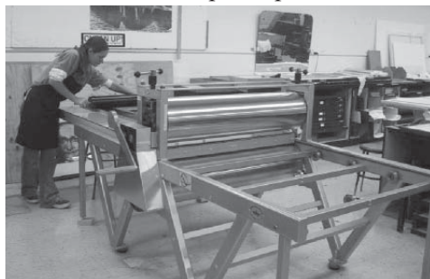
New press in use: Kelly Naschert, from the Intaglio II class, at work on a woodcut.

The Printmaking Area is very pleased to have a new hand-operated etching press from the Takach Press Corporation of Albuquerque, New Mexico. The bed of the press is 44 by 84 inches, a significant increase in size from the previous presses. Students have been enjoying the greater size possibilities in their work. The fundraising efforts included the following combination of funds to make the purchase of the new press possible: the