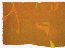
Pools by Lea Friesen three color woodcut, monoprint, and collé 8 1/4" x 11 1/4" copyright 2005, matted Retail price: $50.00

All proceeds from the silent auctions and raffles will go to support the ISU printmaking program. Please show your support for the ISU printmaking area and students by your attendance at the sale and exhibition. Information about sales in other media areas is available at the Art office, phone 438-5621. We look forward to seeing you at this special event.