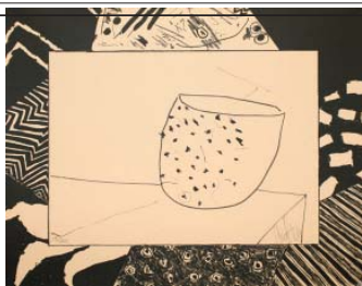
untitled by David Tell one-color lithograph 11" x 14" copyright 1980, matted Retail price: $50.00

One unframed impression of untitled by David Tell and Pools by Lea Friesen will be raffled.