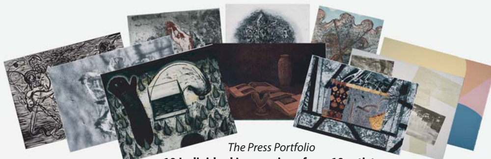
The Press Portfolio

Donations may be sent payable to ISU Foundation, Memo: NEW