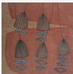
Untitled by Sarah Smelser four color woodcut, monotype & collé, 9" x 9" © 2000, min. bid $200.00 framed retail price: $400.00 unframed