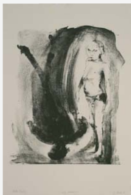
Child and Bully by Harold Boyd one color lithograph, 22" x 15" © 2008, min. bid $100.00 framed retail price: $125.00 unframed

© 2000, minimum bid $900.00, retail price: $1500.00 for suite minimum bid $100.00, retail price: $150.00 for individual prints