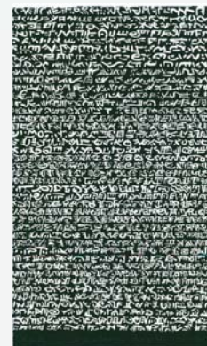
Plank by John Himmelfarb one color lithograph, 11" x 6 1/2" © 1999, min. bid $200.00 framed retail price: $400.00 unframed

Don't miss this opportunity to acquire valuable prints by nationally recognized artists!