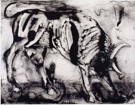
Cretan Bull by Rudy Pozzatti one-color lithograph, 26 3/4" x 34 1/2", 2009