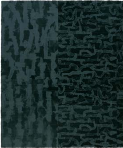
Silent Auction Item: GroundCover--Winter by Julia Fish, 1997, two-color lithograph 21" x 17 1/2" image, 30" x 24" framed