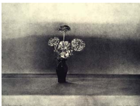
Silent Auction Item: Single Flower Vase by James D. Butler, 1985, one-color lithograph 14 5/8" x 19 3/8" image, 30" x 24" framed

The 26th Annual Printmakers' Exhibition and Sale will be held on Friday, December 10th from 8 AM to 5:00 PM in the lithography studio, room 127 in the Center for the Visual Arts (CVA) building. All prints are original artworks by ISU students, faculty, staff, alumni, and visiting artists. CVA is located on the south side of campus on Beaufort Street. Hourly parking is available at the south University structure on University Street.