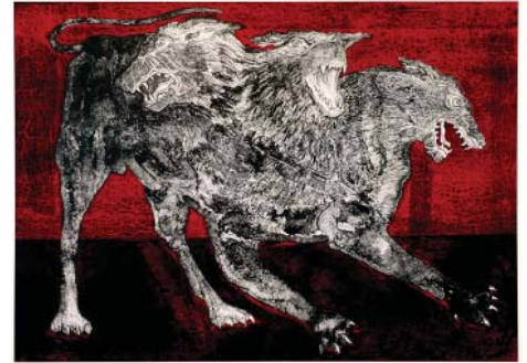
Cerberus by Rudy Pozzatti two-color lithograph, 24 3/4" x 34 1/2", 2009