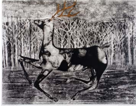
Stag with Golden Horns by Rudy Pozzatti two-color lithograph, 26 3/4" x 34 3/4", 2009