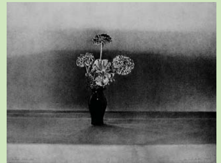
A Single Flower Vase by James D. Butler one-color lithograph, 14 5/8" x 19 3/8" © 1985, min. bid $75.00 framed retail price: $100.00 unframed