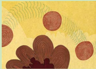
Coming Home* by Sarah Smelser woodcut and monotype, 10" x 15" © 2010, min. bid $300.00 framed retail price: $600.00 unframed * Designated for Printmaking Student Travel Fund