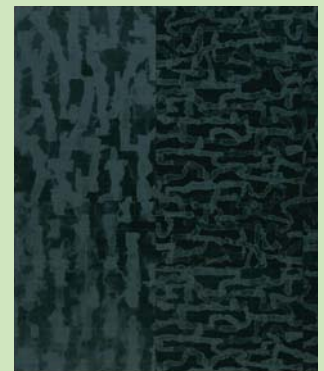
GroundCover-Winter by Julia Fish two-color lithograph, 21" x 17 1/2" © 1997, min. bid $350.00 framed retail price: $700.00 unframed