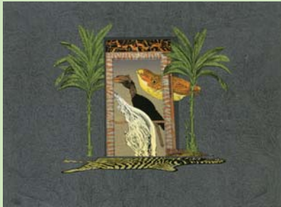
Two Birds and a Bad Dive by Wayne Kimball ten-run lithograph, 11" x 15" © 2007, min. bid $150.00 framed retail price: $350.00 unframed

100% of proceeds from selected works will go to the Printmaking Student Travel Fund to support student participation in national conferences.